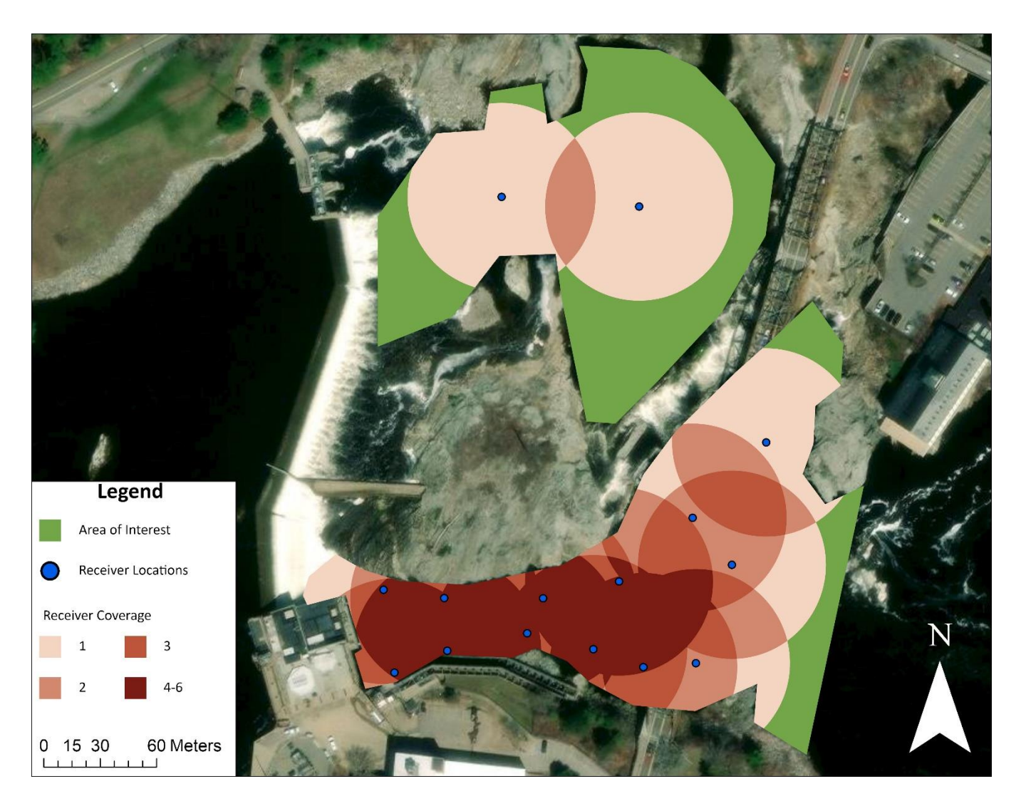
Figure 1. Example receiver configuration below the Brunswick Hydroelectric Project for use in the Diadromous Fish Behavior, Movement, and Project Interaction Study. Green is the assumed area of interest, and potential receiver locations are shown as blue circles. Receivers in this figure have an assumed range of 50 m, represented by the larger circles extending beyond receiver locations. The color of the larger circles represents the number of overlapping receivers covering a particular area, with dark colors indicating more receiver coverage. The literature suggests that simultaneous coverage of at least four receivers is needed to obtain accurate 3D locations for tagged fish. The number of receivers indicated does not necessarily represent the maximum number of receivers needed for the study.

http://www.Maine.gov/dmr PHONE: (207) 624-6550 FAX: (207) 624-6024